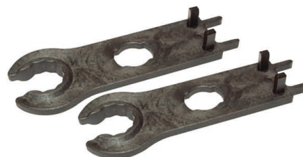
Installation wrench set PV-MS