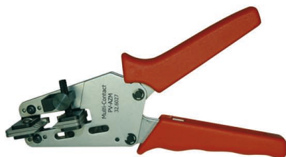
Insulation stripper PV-AZM (1,5 / 2,5 / 4 / 6 mm 2 )